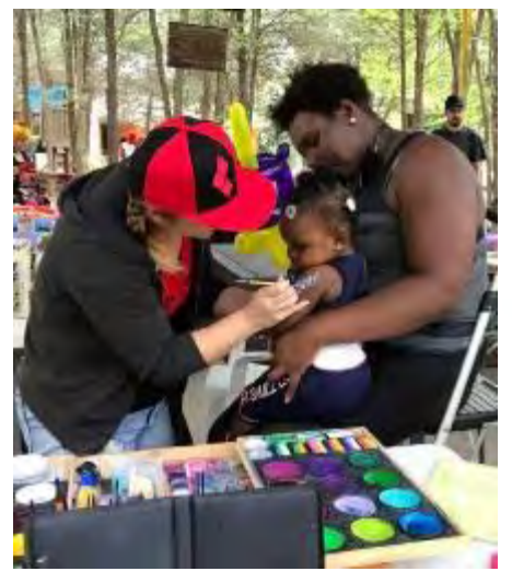
FACE PAINTER (2 Hours)