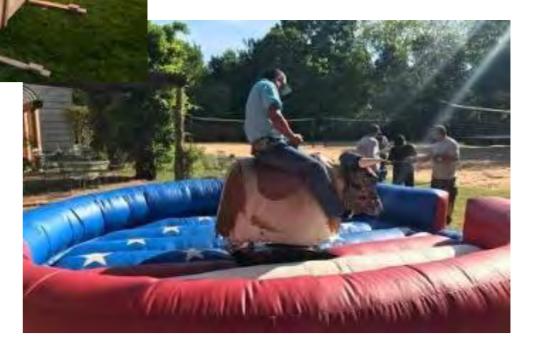
MECHANICAL BULL (4 hours) $850.00+

*Saturday evening events priced upon request Want someone to lead dances, emcee games and contests, and announce when activities are opening and closing? They've got you covered!