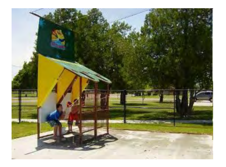
SHOWDOWN Water Balloon Launchers (1 Hour) Additional hours: $100.00 per hour