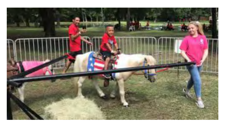
PONY CAROUSEL (2 hour minimum) $375.00+ per hour