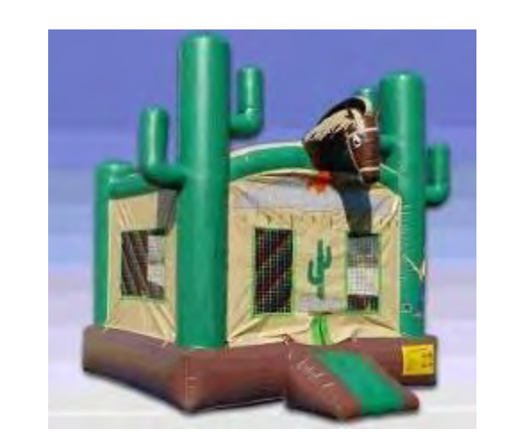
BOUNCE HOUSE (4 hours) $300.00

More than just a bounce house, this big play system includes climbing columns, obstacles, slides, and more!