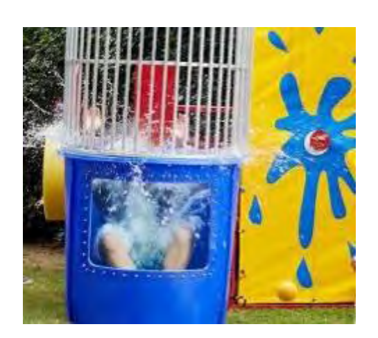
DUNK TANK (4 hours) $400.00+