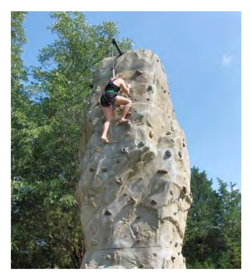
ROCK CLIMBING WALL (1 Hour) Additional hours: $300.00 per hour